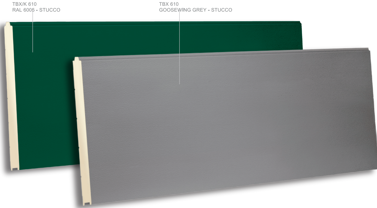
TBX/K 610 RAL 6005 - STUCCO