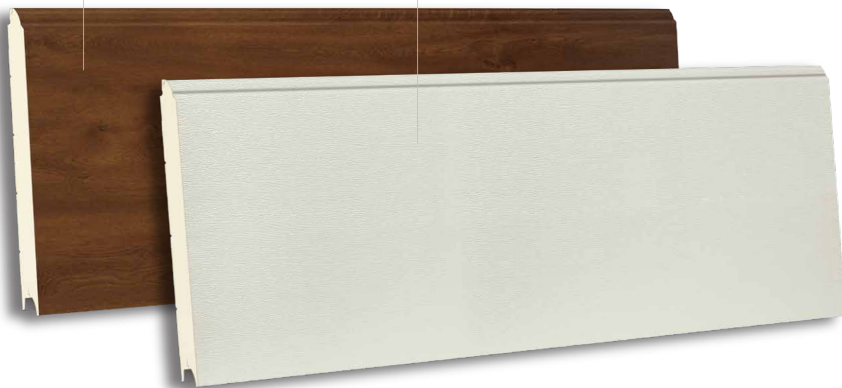
TSX 500 RAL 9010- WOODGRAIN