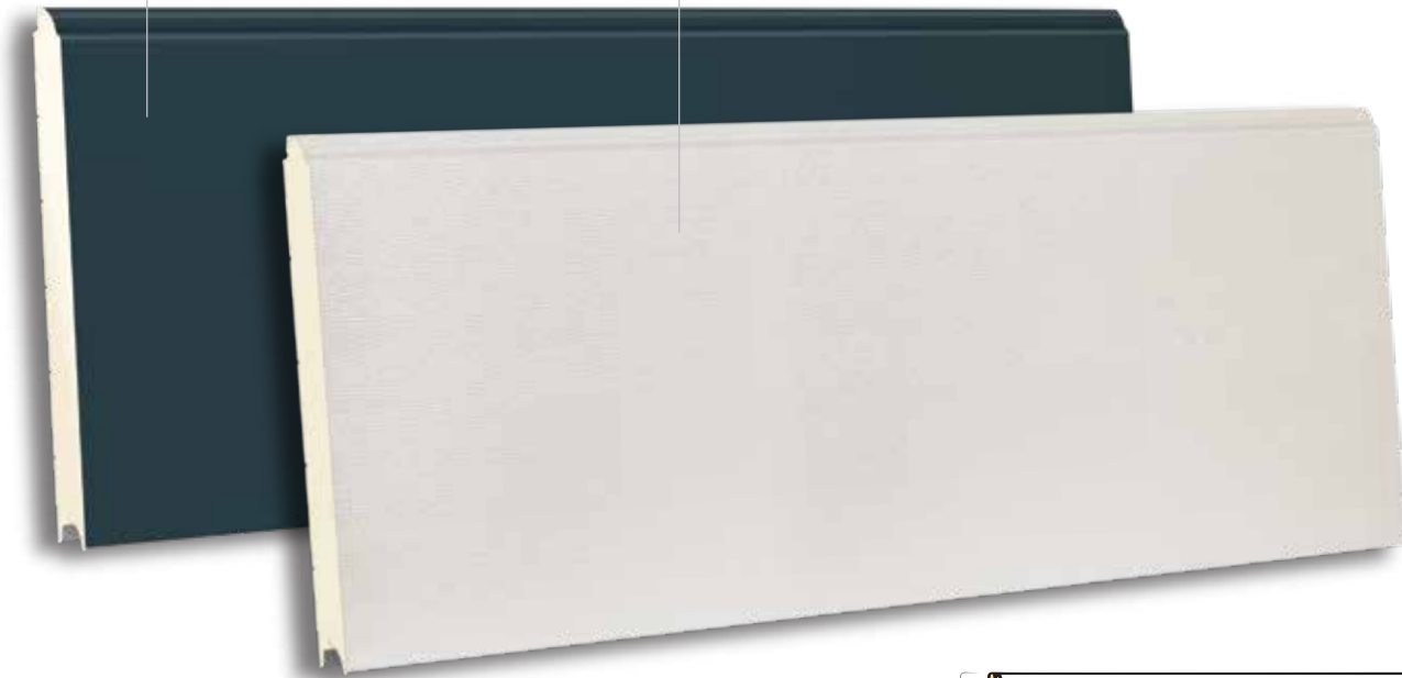
TSX 610 RAL 9002- WOODGRAIN