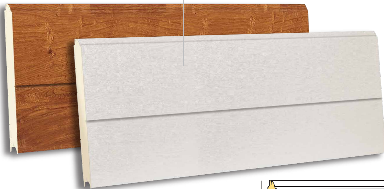
TSV 610 RAL 9010 - WOODGRAIN