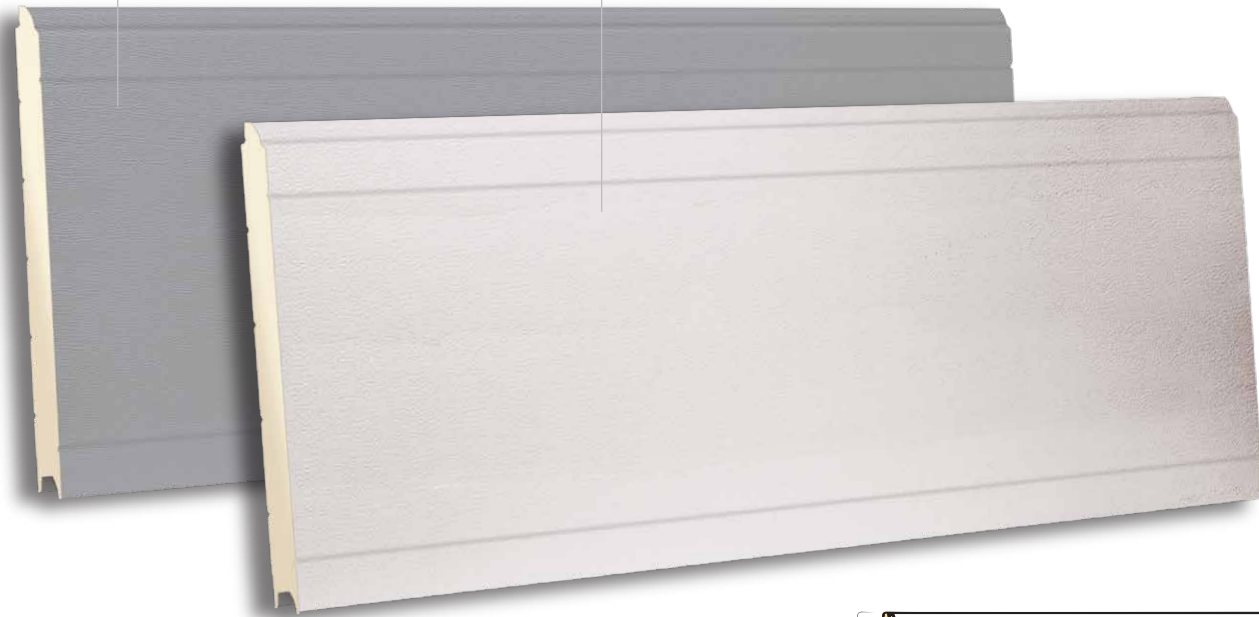
TST 610 RAL 9010 - WOODGRAIN