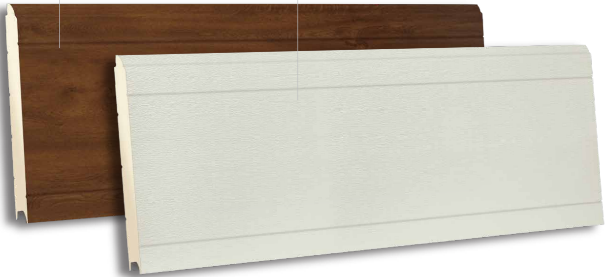
TST 500 9002 - WOODGRAIN