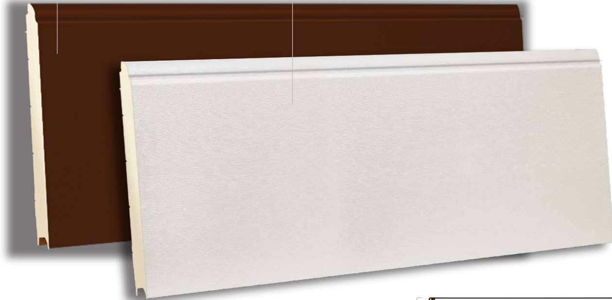
TSS 610 RAL 9002- WOODGRAIN