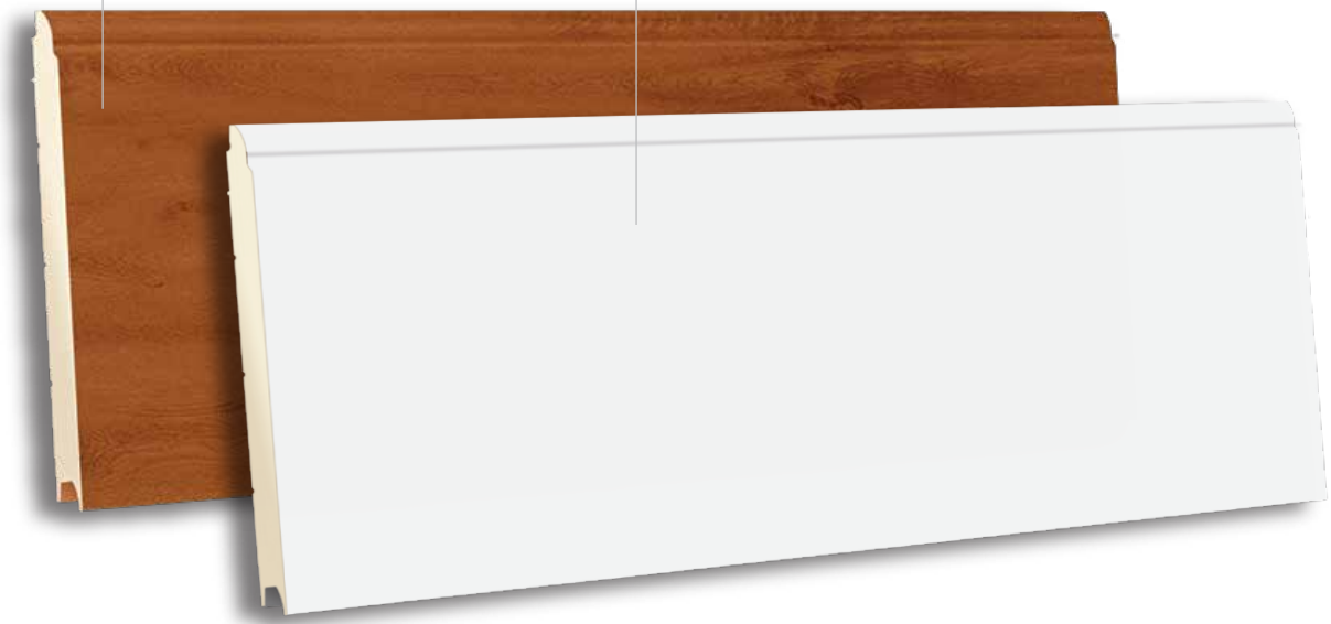
TSS 500 RAL 9016 - POLYGRAIN