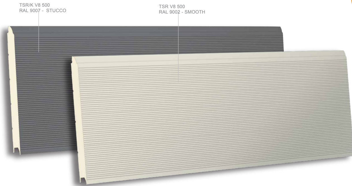
TSR/K V8 500 RAL 9007 - STUCCO