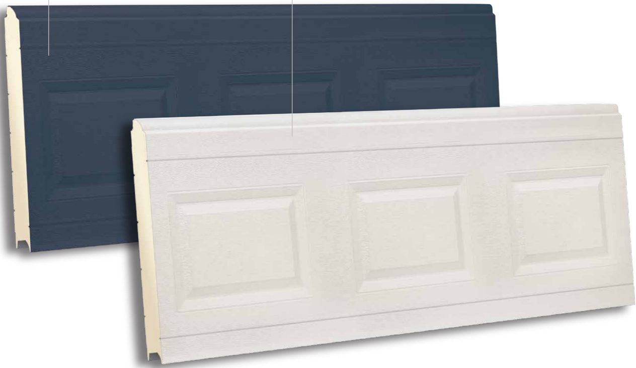
TSQ 610 RAL 9002 - WOODGRAIN