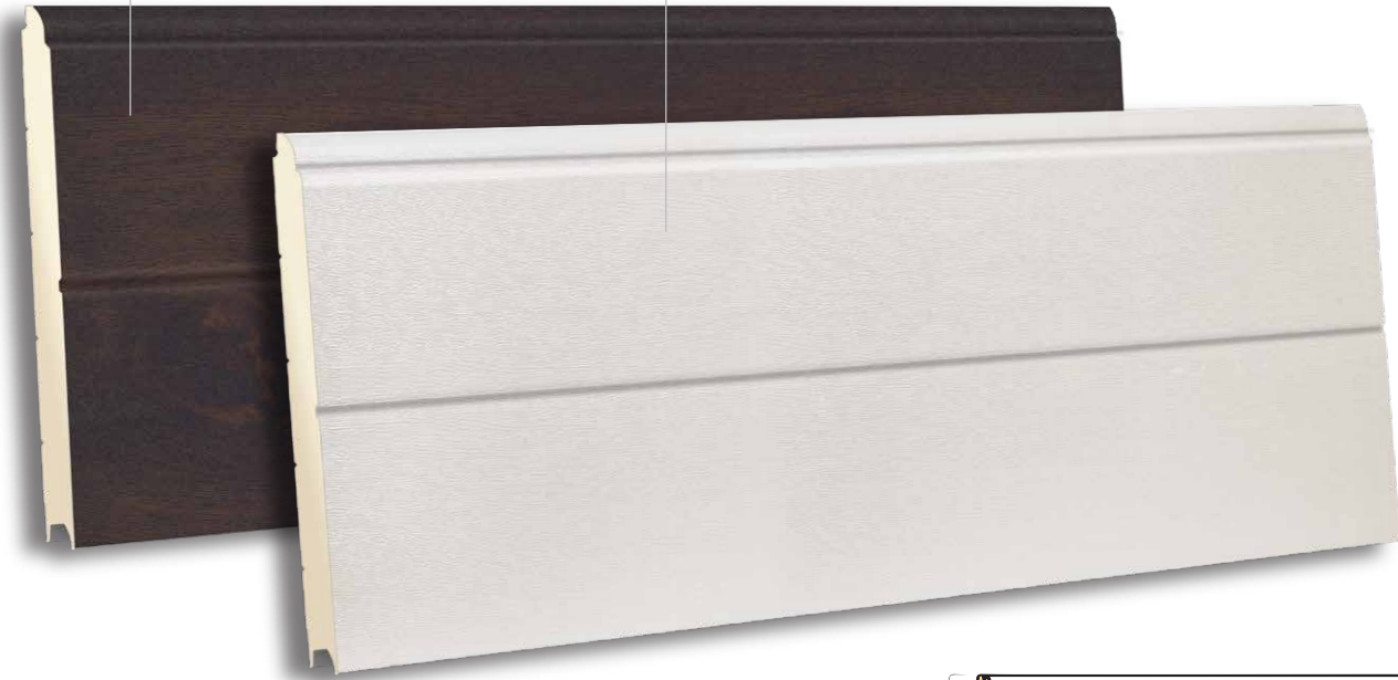
TSL 610 RAL 9010- WOODGRAIN