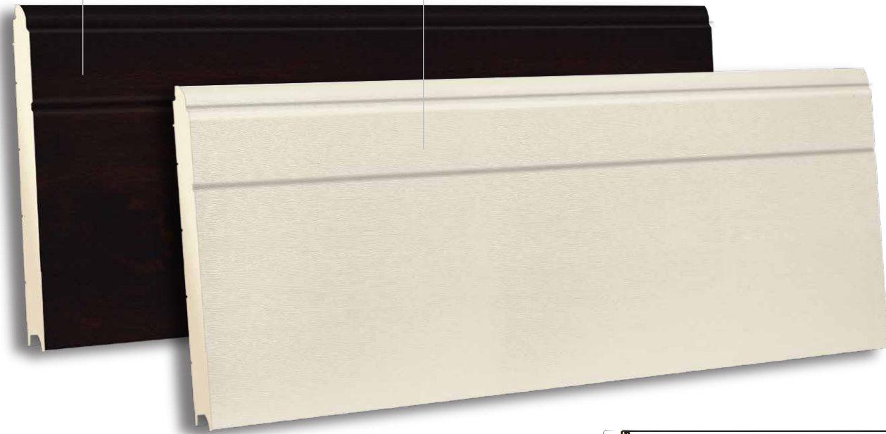
TSD 610 RAL 9002- WOODGRAIN